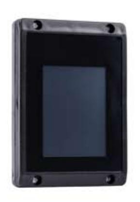
Remote Display Keypad

IP65 / NEMA Class 4X Plug in remote mounting touch screen pad mimics the VMX-synergy™ display and functionality.